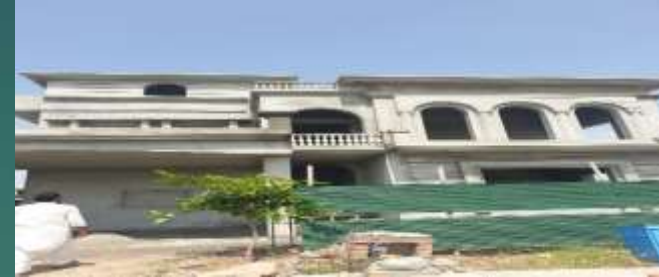
11. Farm House No233, Gulberg, Islamabad