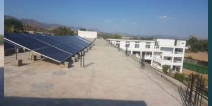
APS Kohat (Main Campus/ Girl Campus/Pre School and Special children School Solar Power System installation (60 Kw to 200KW)