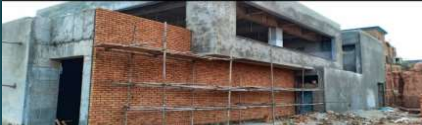
12. Frobel's , Gulberg, Islamabad