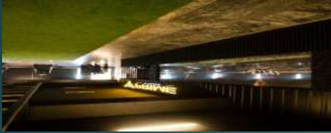
10. Prime Gym , Rawalpindi