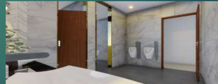
15. Uplift of Jinnah Auditorium , Mangla Cantt, Jehlum