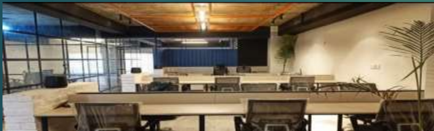
14. IT Office , Uplifting & Renovation , Bahria Phase-7, Islamabad